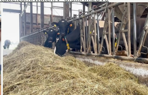
Photo credit: photos generated from farmer interview - Grünlandzentrum Niedersachsen/Bremen