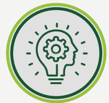
improvement of grassland management